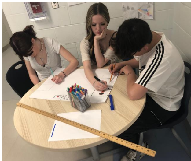
12 - Grade 8 projects about Japan

As it is now sandal season, just a friendly reminder to be sure your kids are bringing their runners for PE still; this is a piece of safety that is important, especially as many classes are now doing their Track & Field units.