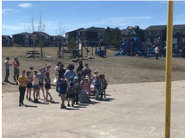
10 - Outside fun with buddy classes in the sun