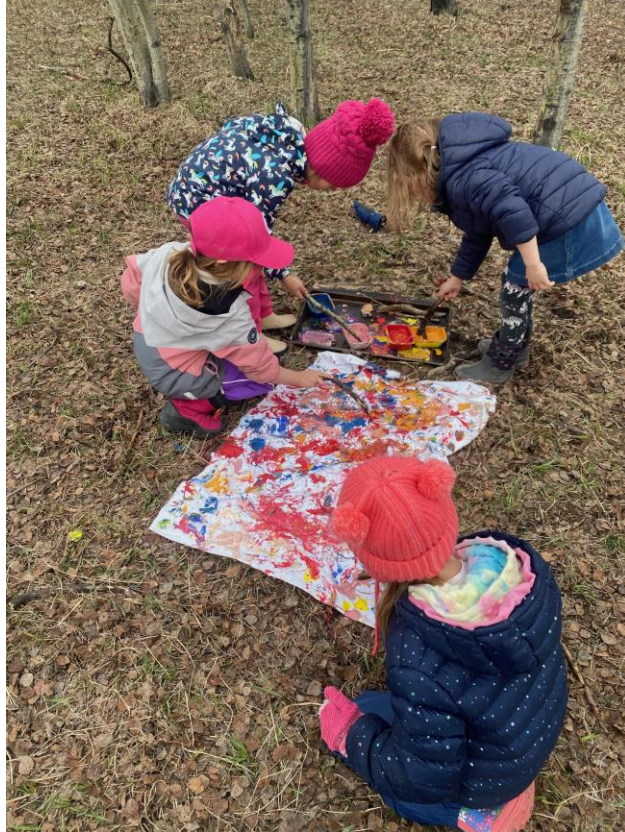
5 - Kinder Nature Art Painting