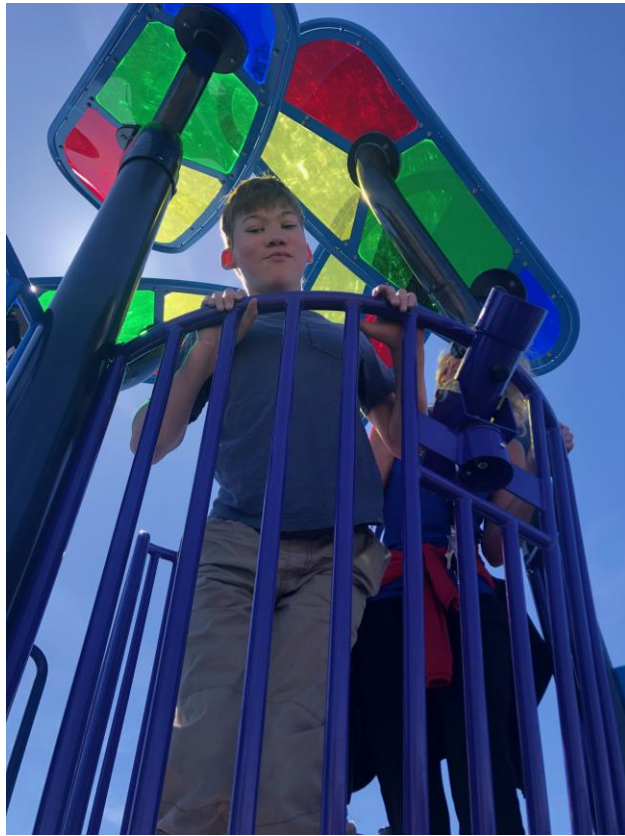
1 - Recess in the Sun!