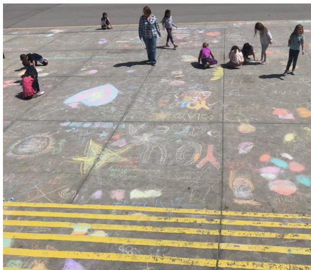
2 - Chalk About It!