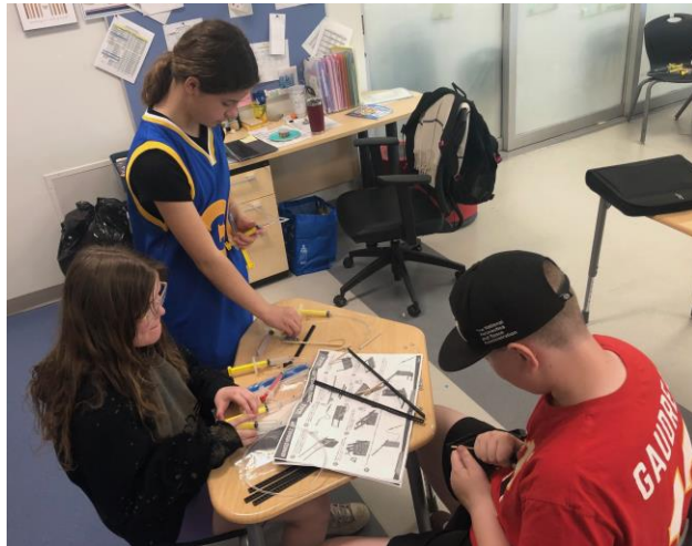
7 - Grade 6 Science - learning about forces