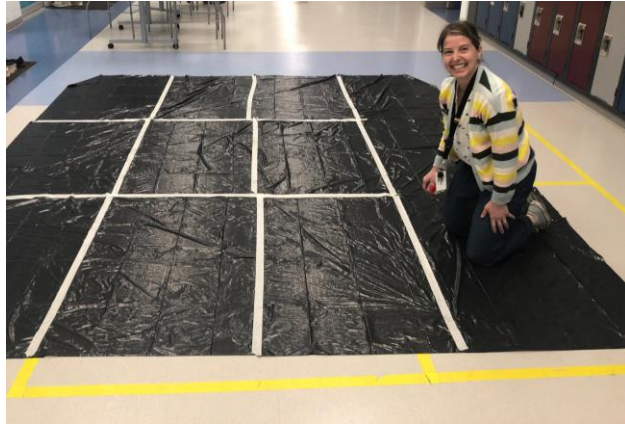
13 - Preparing for the Egg Drops