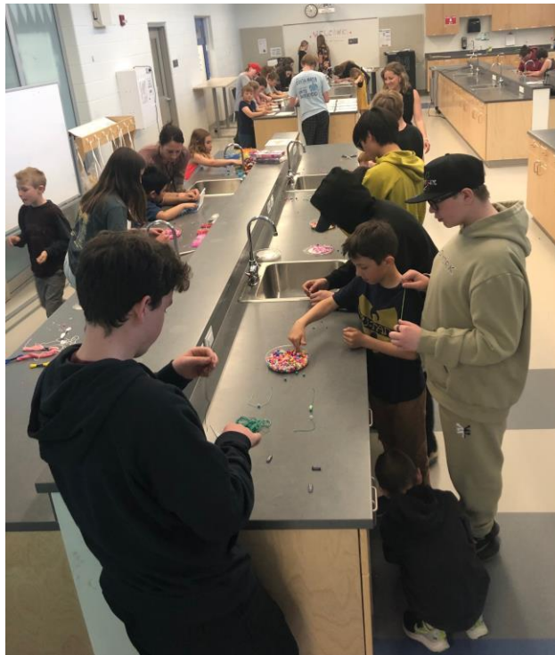
11 - Fireside Families Buddies